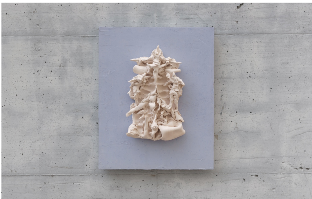
Holy Water , 2021, ceramic relief on painted fir panel, 50 x 40 x 18 cm