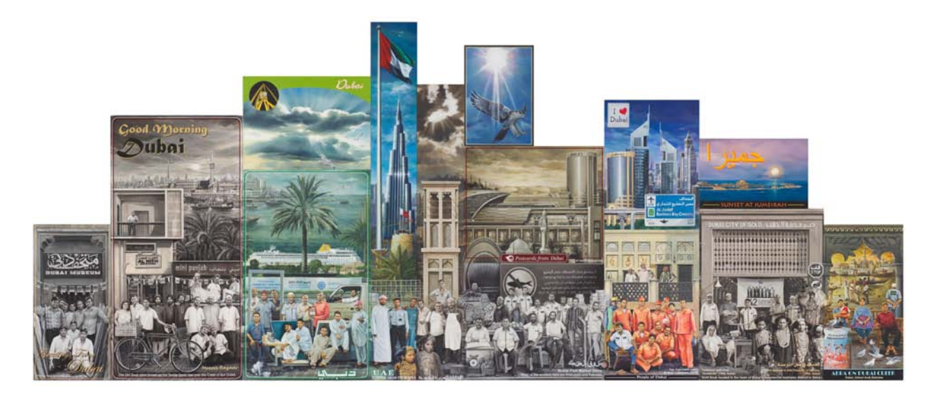
Postcards from Dubai (Day), 2014, acrylic on canvas, 230 x 555cm (13 panels)

For press inquiries, please contact Irene Fung at irene@yavuzfineart.com or at (65) 6338 7900.