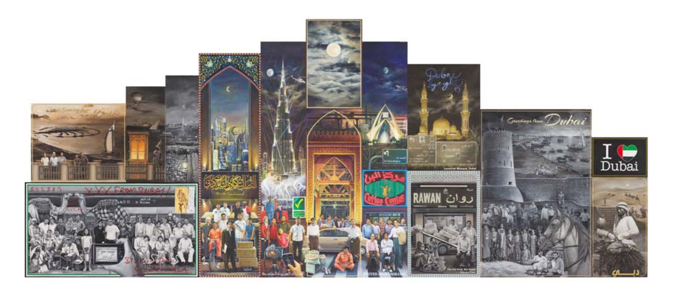
Postcards from Dubai (Night), 2014, acrylic on canvas, 230 x 555cm (13 panels)