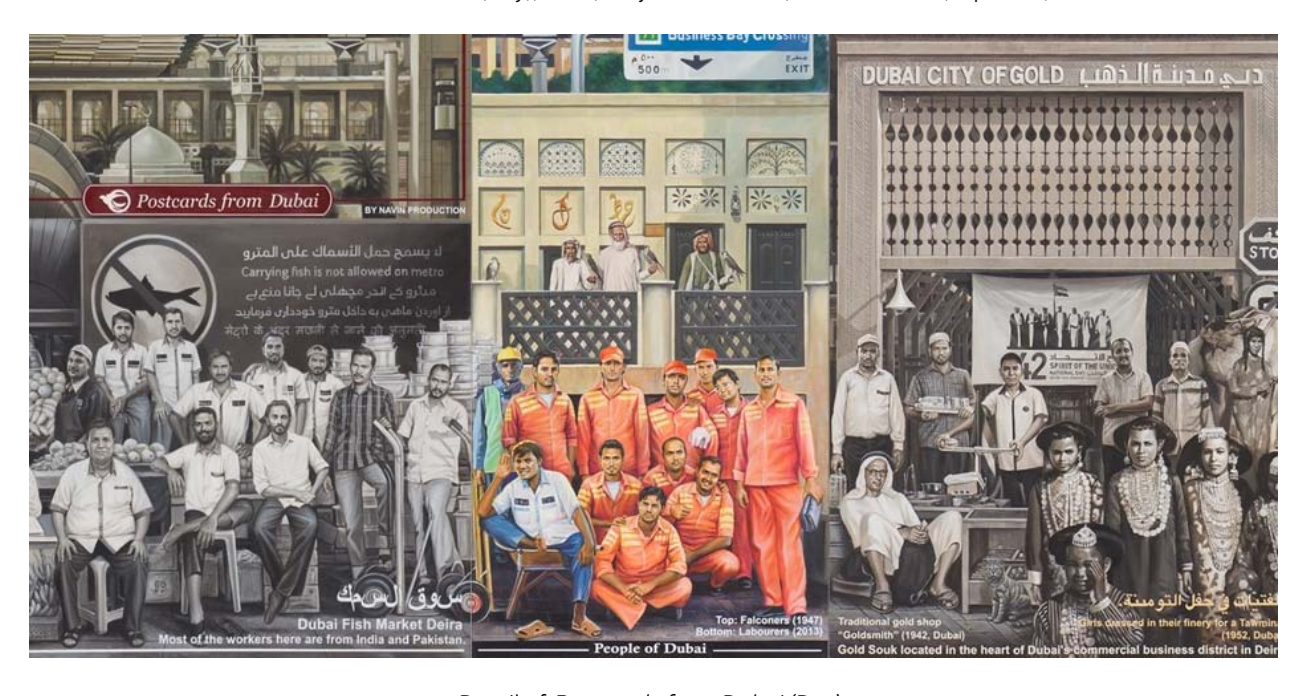
Detail of Postcards from Dubai (Day)