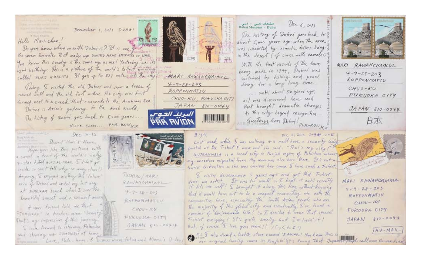
Postcards from Dubai (detail), 2014, acrylic on canvas, 230 x 325cm (6 panels)