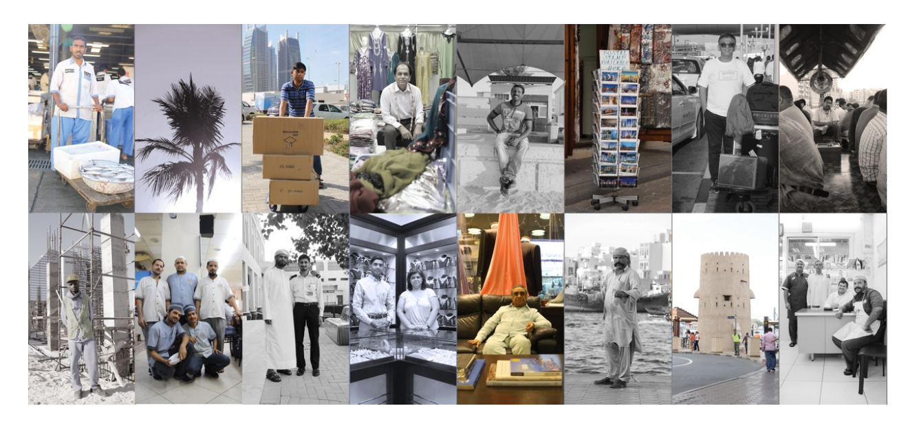
Postcards from Dubai, 2014, single channel video, HD digital