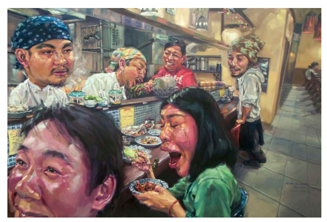
The Spiciest in the World, 2012, oil on canvas, 200 x 300cm