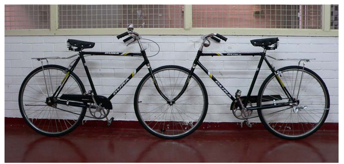
No Turn, 2012, mixed media, 300x40x120cm