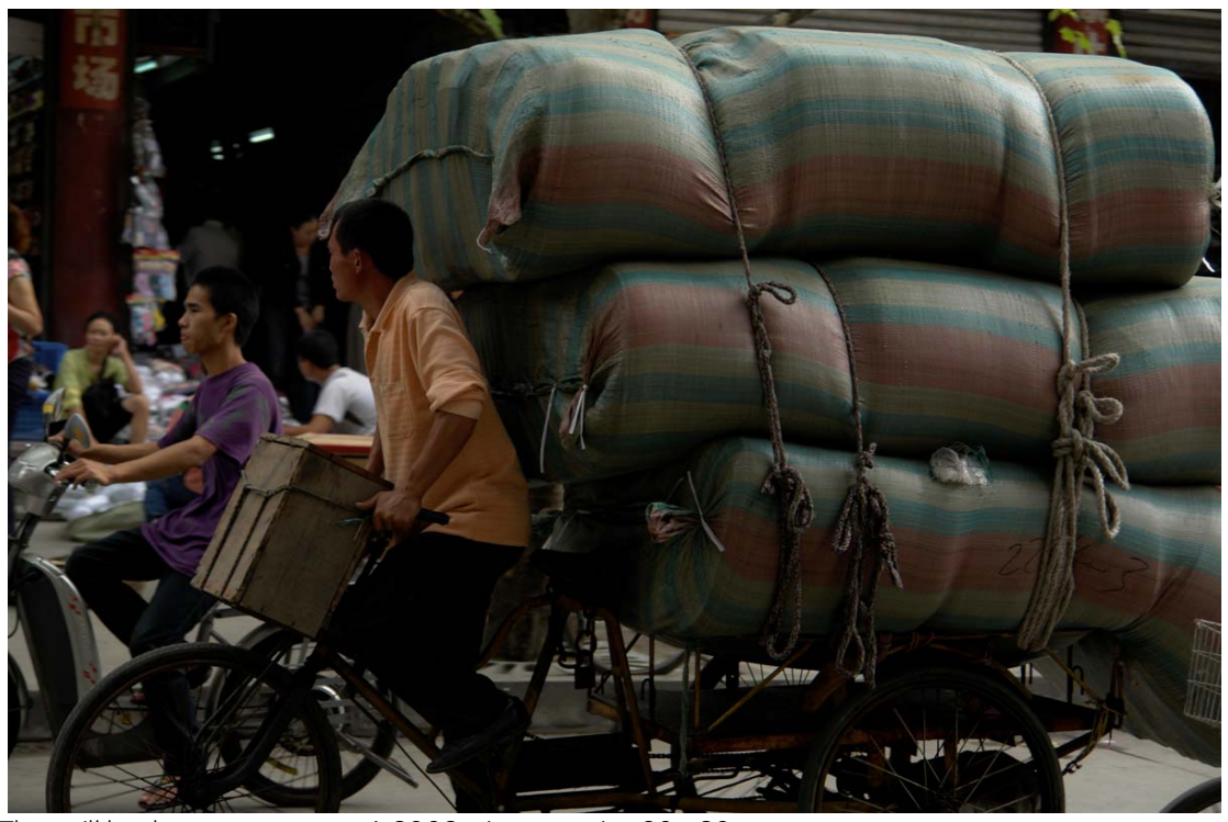
They will be there next year no. 4, 2008, pigment print, 30 x 20cm