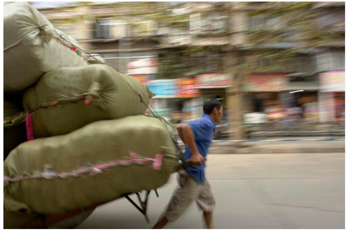
They will be there next year no. 5, 2008, pigment print, 30 x 20cm