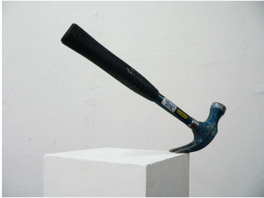
Untitled CG, 2012, mixed media, 110x165cm