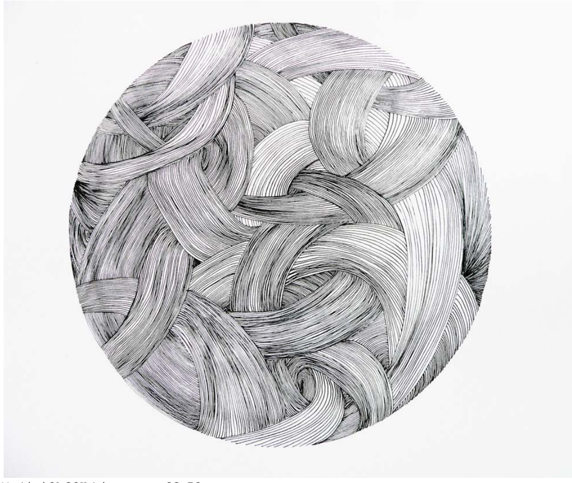
Untitled 01, 2011, ink on paper, 38x56cm