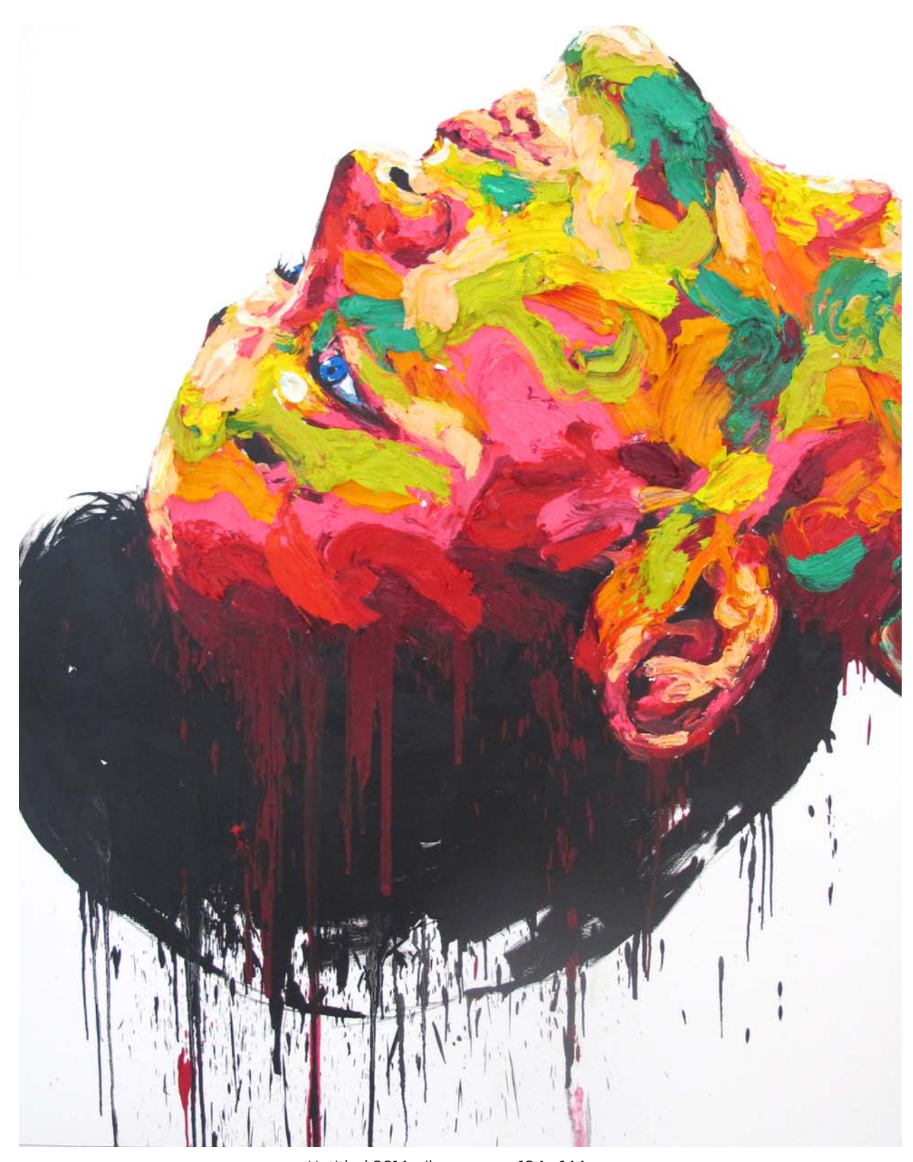
Untitled, 2014, oil on canvas, 194 x 144cm