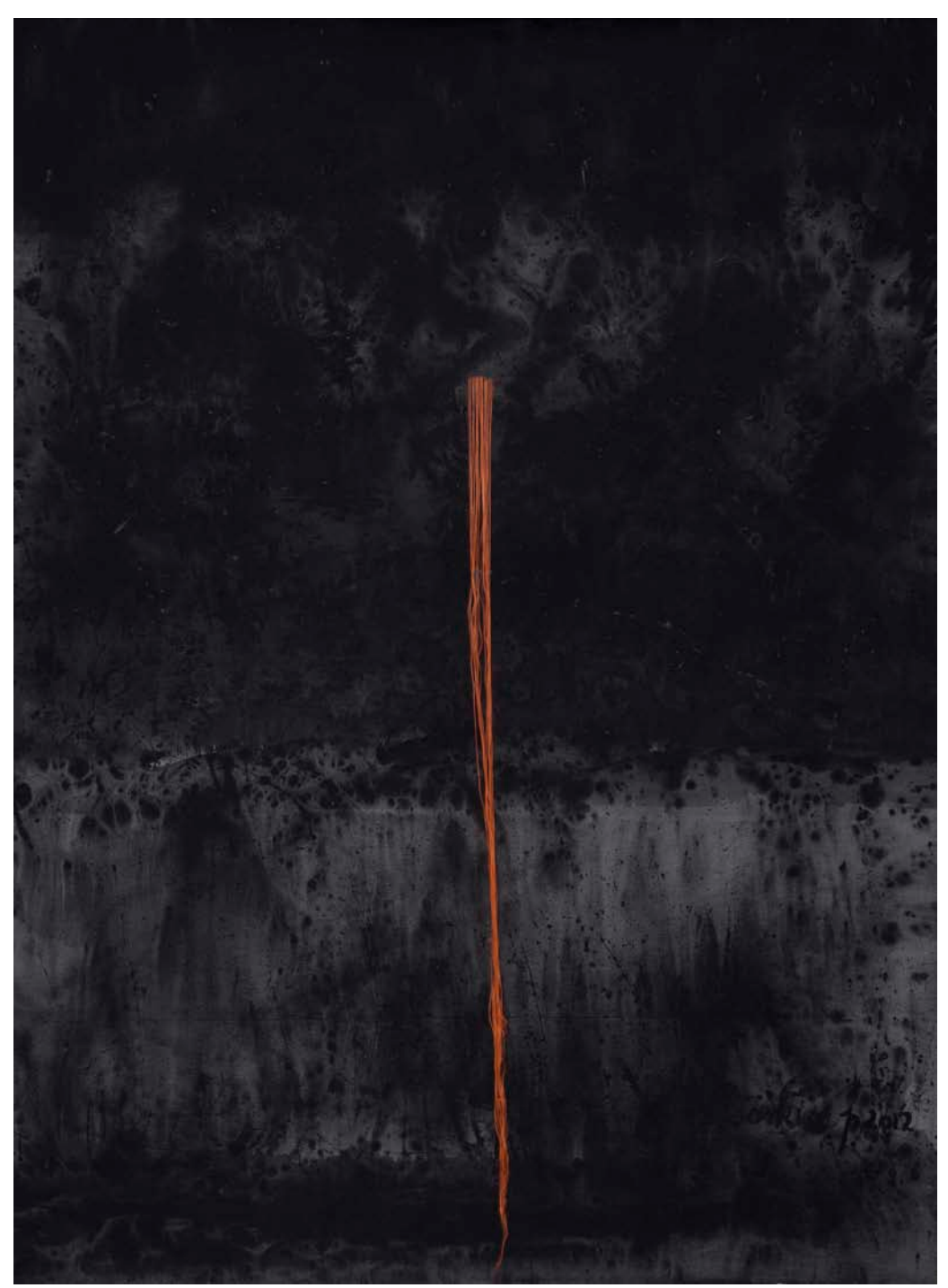
Looking For The God Particle V, 2012, acrylic and nylon thread on canvas, 216 x 160cm