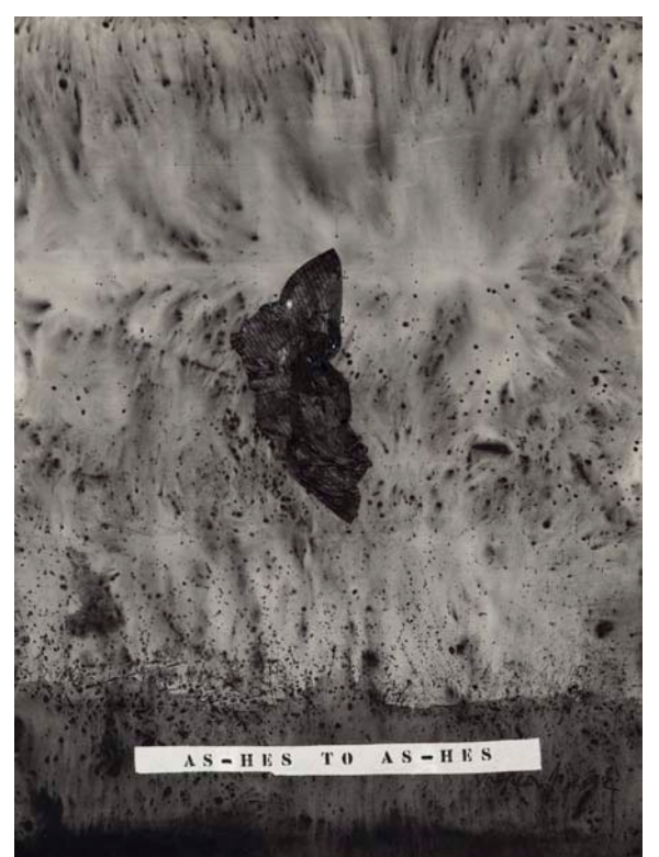
Ashes To Ashes, 2012, acrylic and cotton rag on canvas, 216 \times 160cm