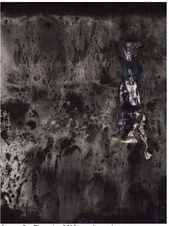
Space For Thought, 2012, acrylic and cotton rag on canvas, 216 \,\mathrm{x}\,160\mathrm{cm}