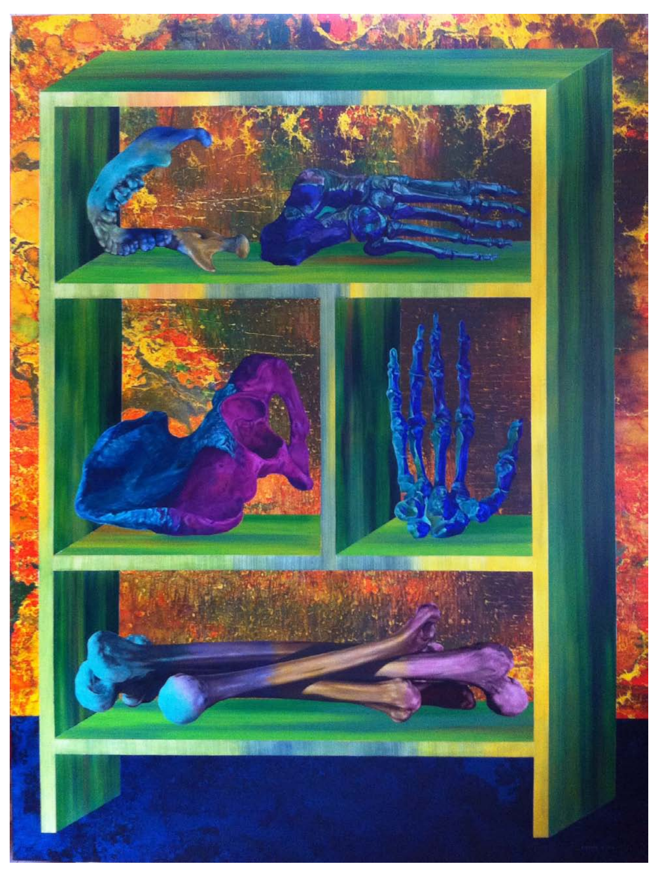
Bones Shelf, 2014, oil on canvas, 200 x 150cm