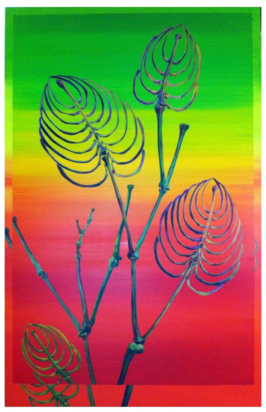
Beyond The Tree, 2014, oil on canvas, 220 x 139cm