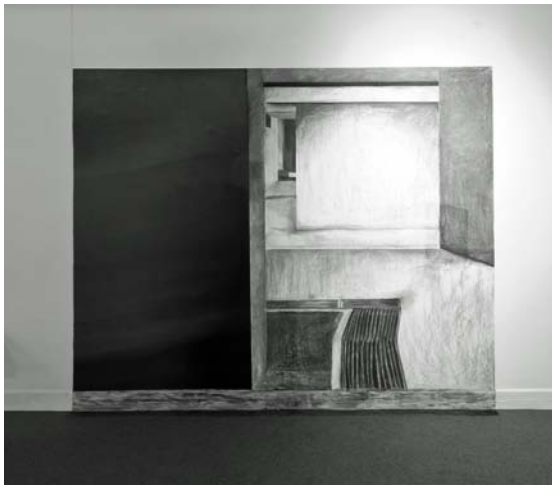
Tang Ling Nah, Contemplating Waterloo