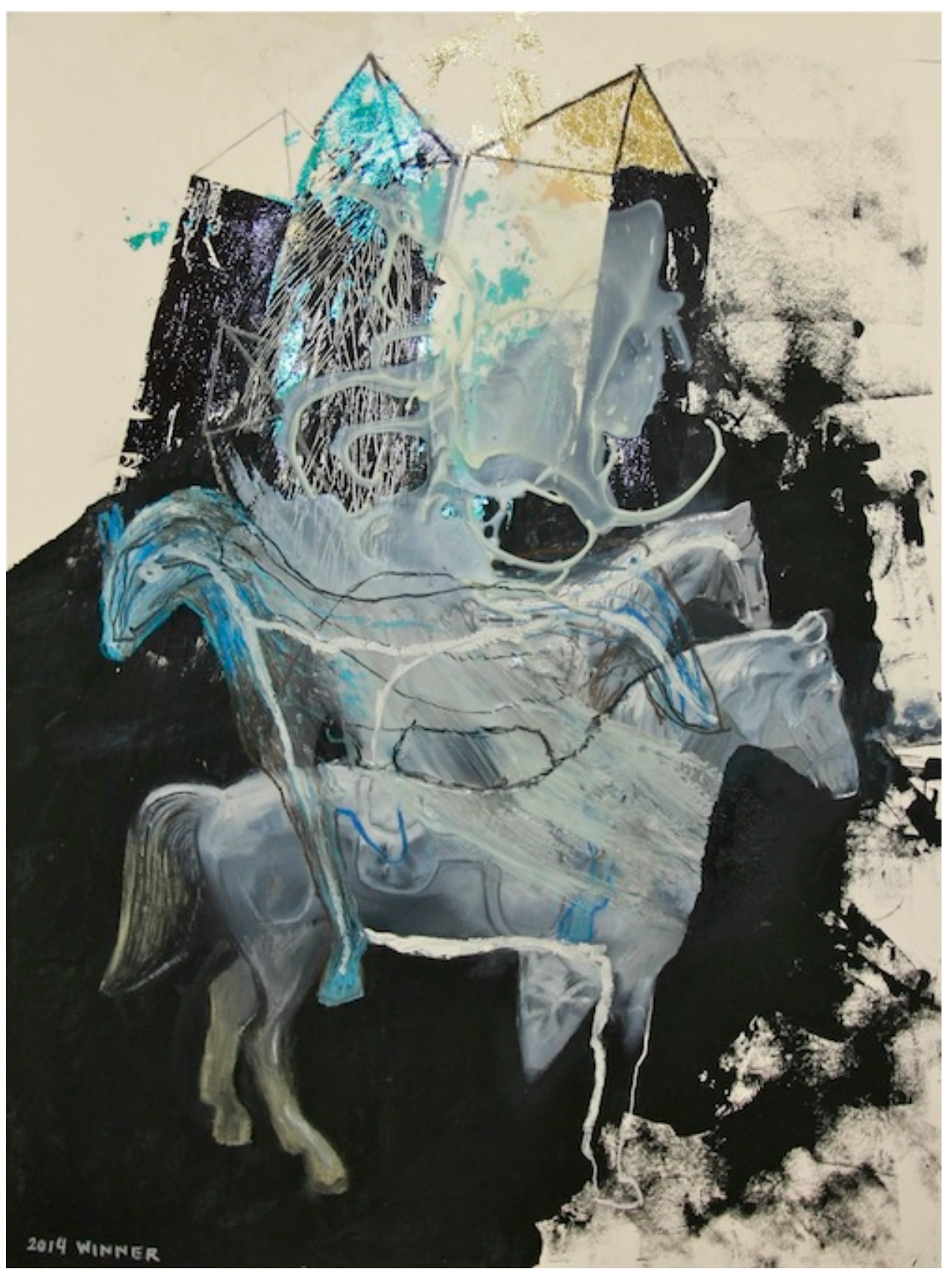
Donde Paso (Way), 2014, mixed media on paper, 76 x 56cm