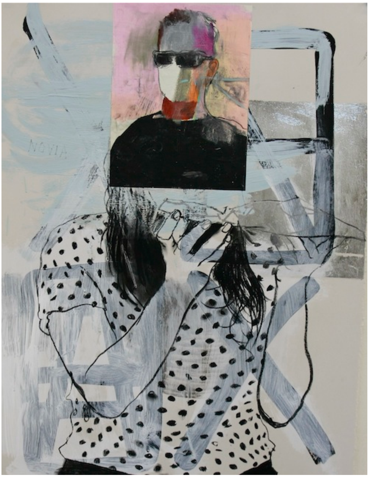
Espejo (Mirror), 2014, mixed media on paper, 76 x 56cm