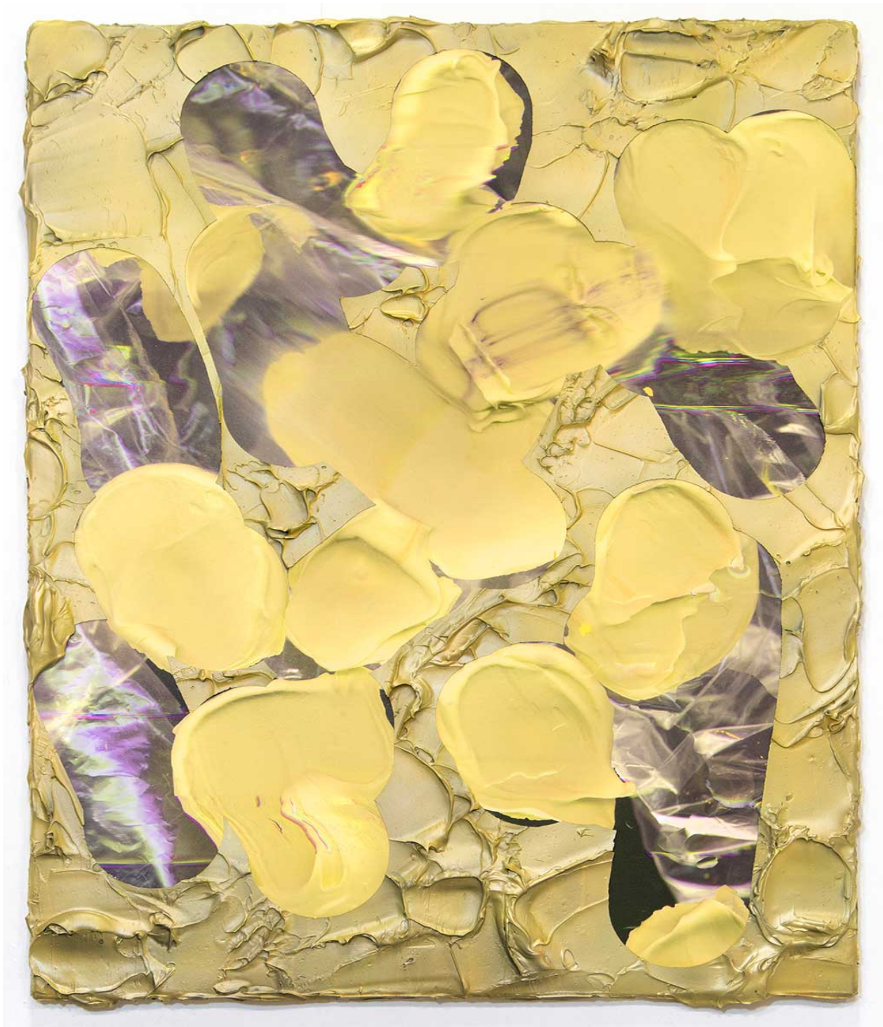
Andre Hemer , Big Node #27 , 2015, acrylic and pigment on canvas, 120 x 90cm