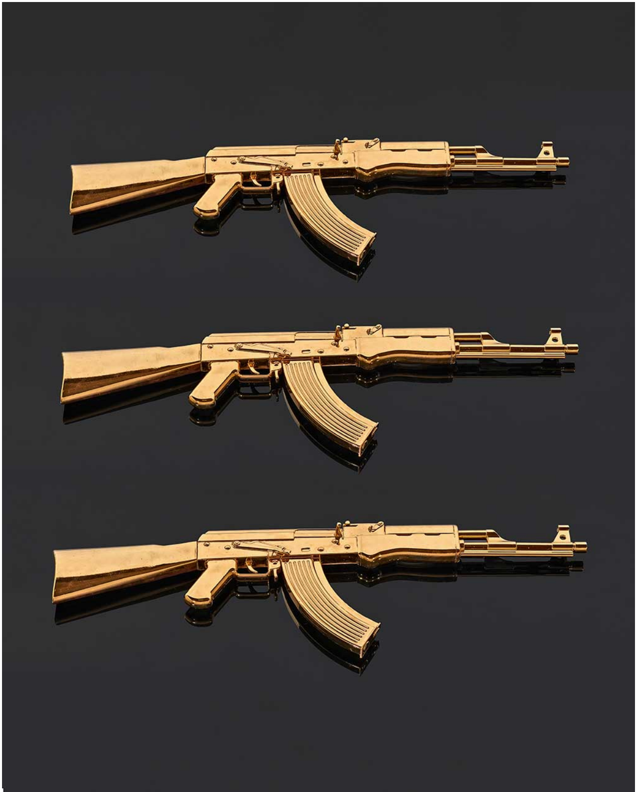
Penny Byrne, Weapons of Mass Destruction , 2015, porcelain with 24 carat gold gilding, 30 x 93 x 6cm (each)