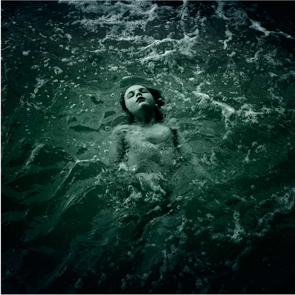
Tamara Dean, Emerge , 2015, photograph on archival fibre based on cotton rag, 150 x150cm