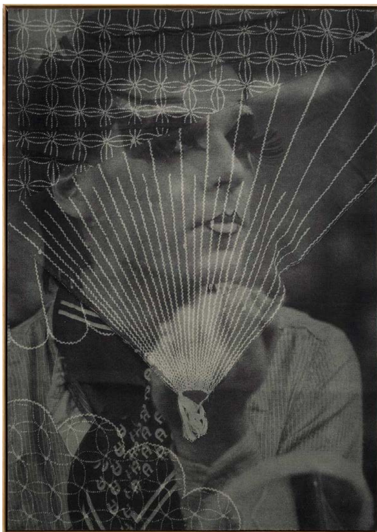
David Noonan, Untitled , 2015, silkscreen on linen collage, 206 x 146cm