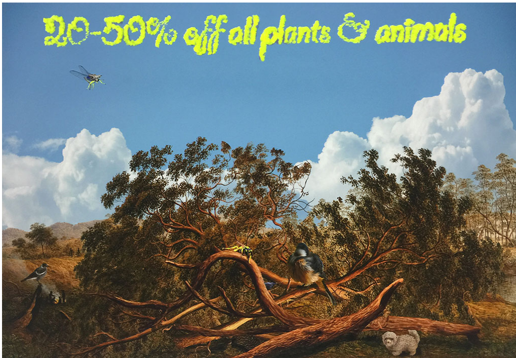
Joan Ross, Stocktake $ale! Now on! , 2015, hand painted pigment on cotton rag paper, 61 x 90cm