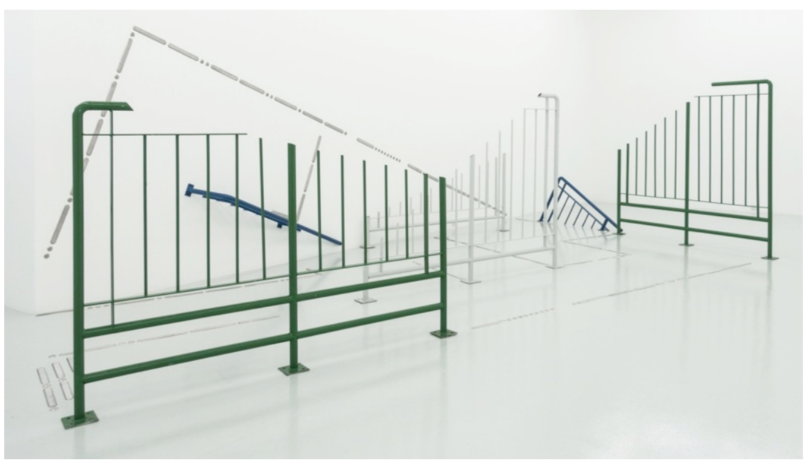
Labyrinths, 2017, stainless steel, galvanized steel, emulsion paint, dimensions variable