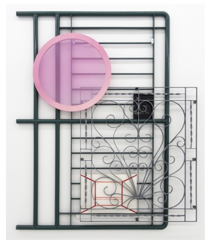
Labyrinths (Open Fire), 2017, galvanized steel, watercolor on cold press paper, acrylic panel, chiffon print on plywood, coated steel, 200 x 164 cm