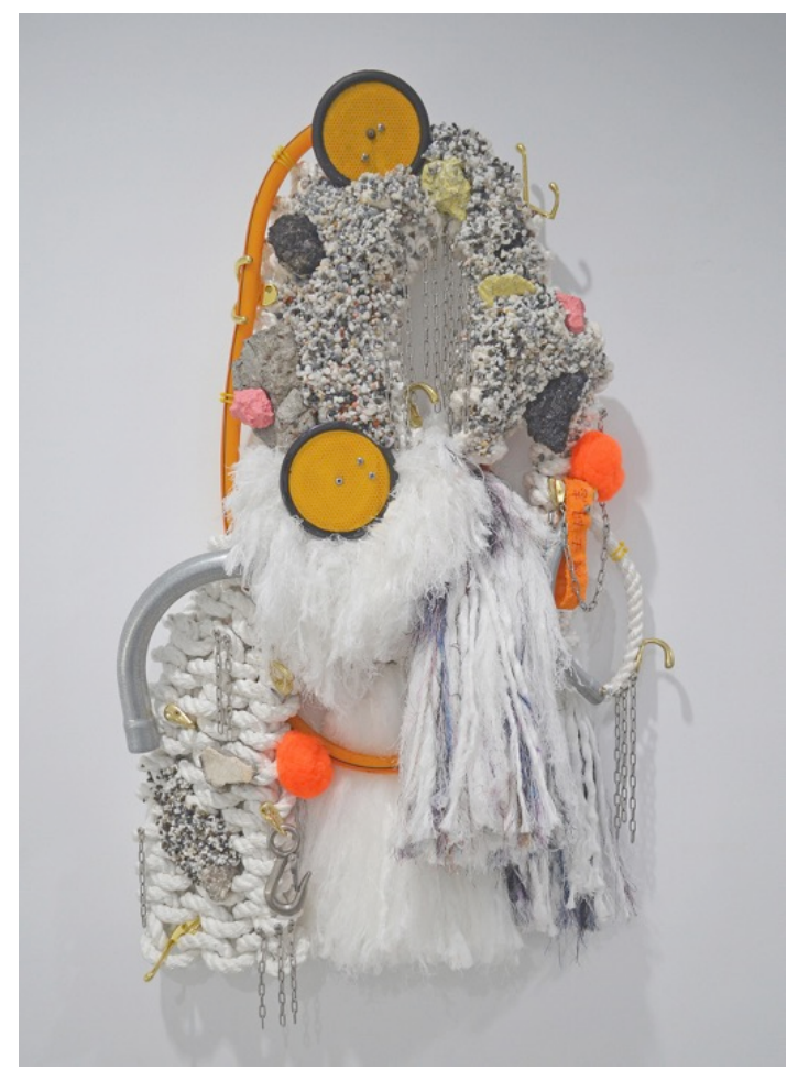
The Still Praying Mantis , 2017, cotton rope, coat hook, masonry fragments, reflective road signs, stainless steel chain, PVC hose, cable tie, metal pipe, sauna towel, festive balls, 90 x 60 cm