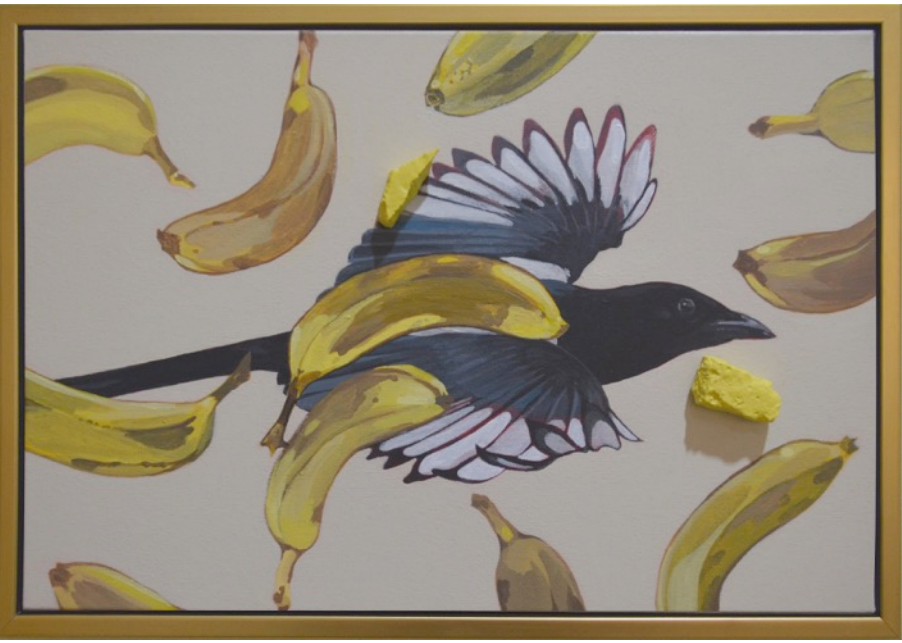
This Yellow, So Warm and Mellow, 2017, acrylic on canvas, 27 x 41 cm

The Opportunist , 2017, manila rope, nylon rope, masonry fragments, screw, stainless steel chain, industrial tape, hose and nozzle, pool drain cover, cricket, ball, coat hook, cable tie, air brake coil fitting, 88 x 71 cm