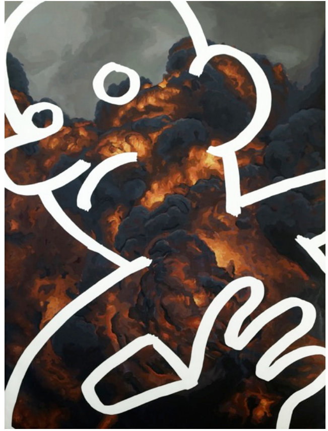
You don't have to say you love me, 2018, oil on linen, 240 x 180 cm