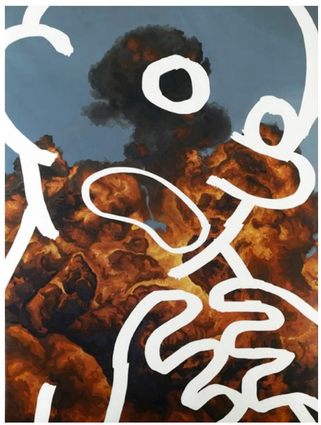
Love is all around, 2018, oil on linen, 240 x 180 cm