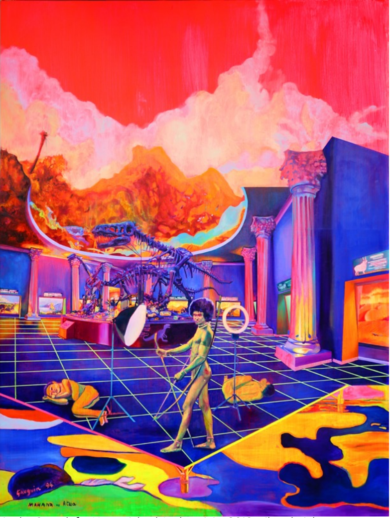
A Brief Guide in the Search for Untarnished Authenticity, 2019, oil and giclee on canvas, 200 x 150 cm