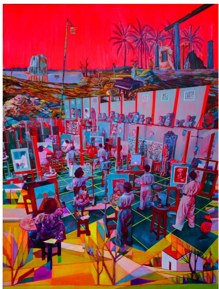
Laboratorium Barat, 2019, oil and giclee on canvas, 200 x 150 cm