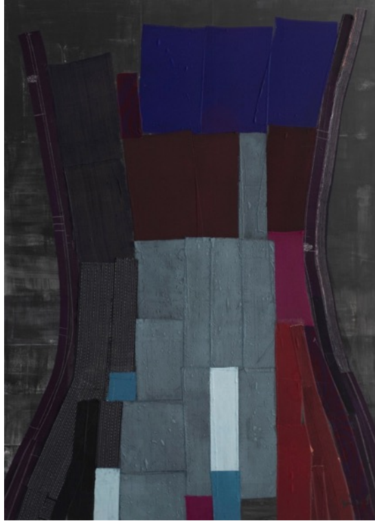
Body of Fragmented Memories II , 2019, textile, paper, acrylic on canvas, 180 x 130 cm.