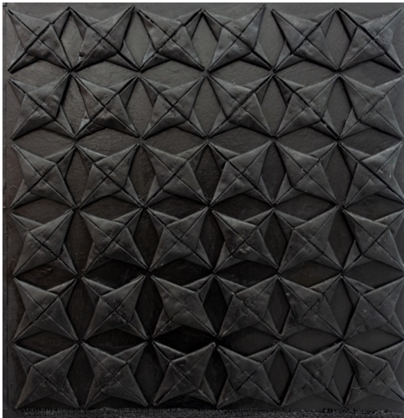
Black Dreams I (detail), 2019