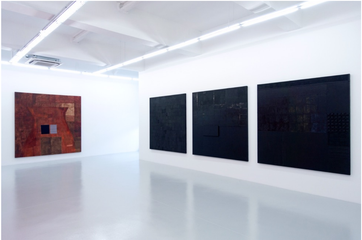
Installation views of Bodily Space: Confessed and Concealed