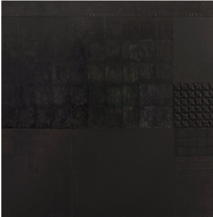
Black Dreams I , 2019, paper, textile, jute, acrylic, ink on canvas, 200 x 200 cm.