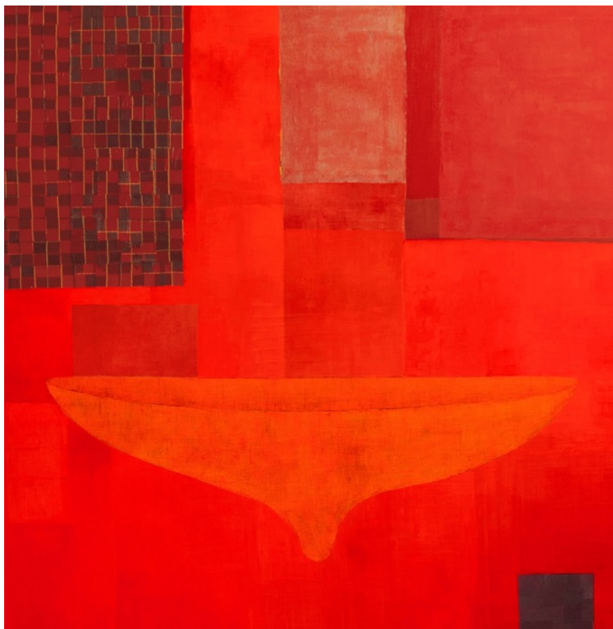
Red Alert! My Body My Space I, 2018-2019, acrylic, pencil, textile, paper on canvas, 250 x 250 cm.