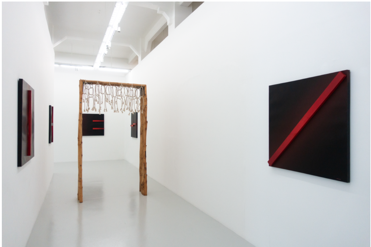
Installation view of Primeval Codes