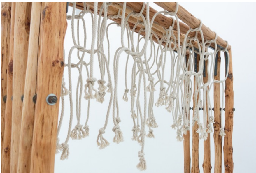
Detail of Aerial Message , 1993-97/ 2020, rope, wood, iron, dimensions variable