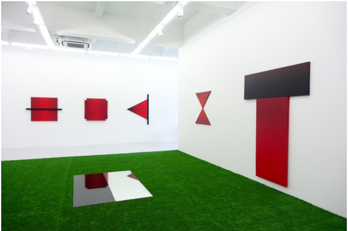
Installation view of Primeval Codes