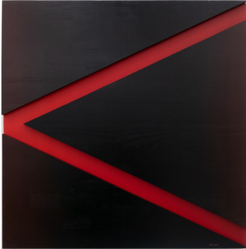
Warrior , 1988 / 2020, oil on canvas and mounted wood, 91 x 92 x 5 cm