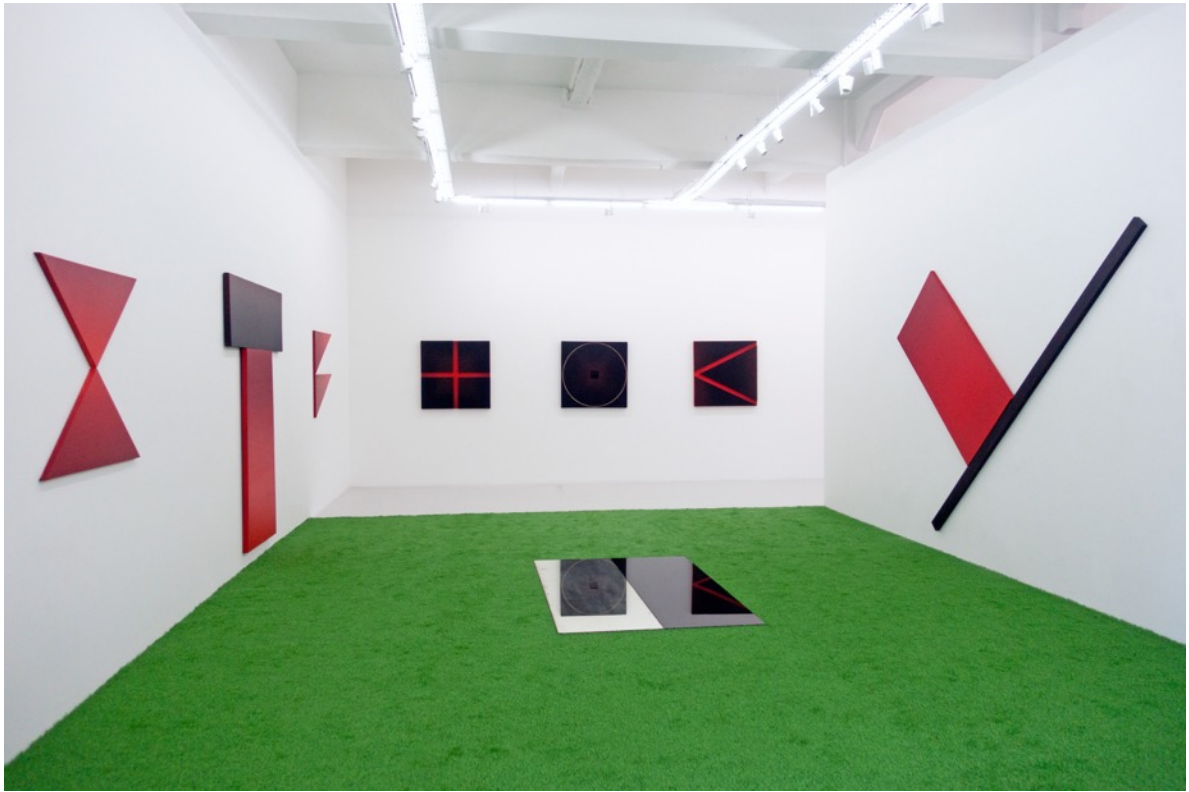
Installation view of Primeval Codes