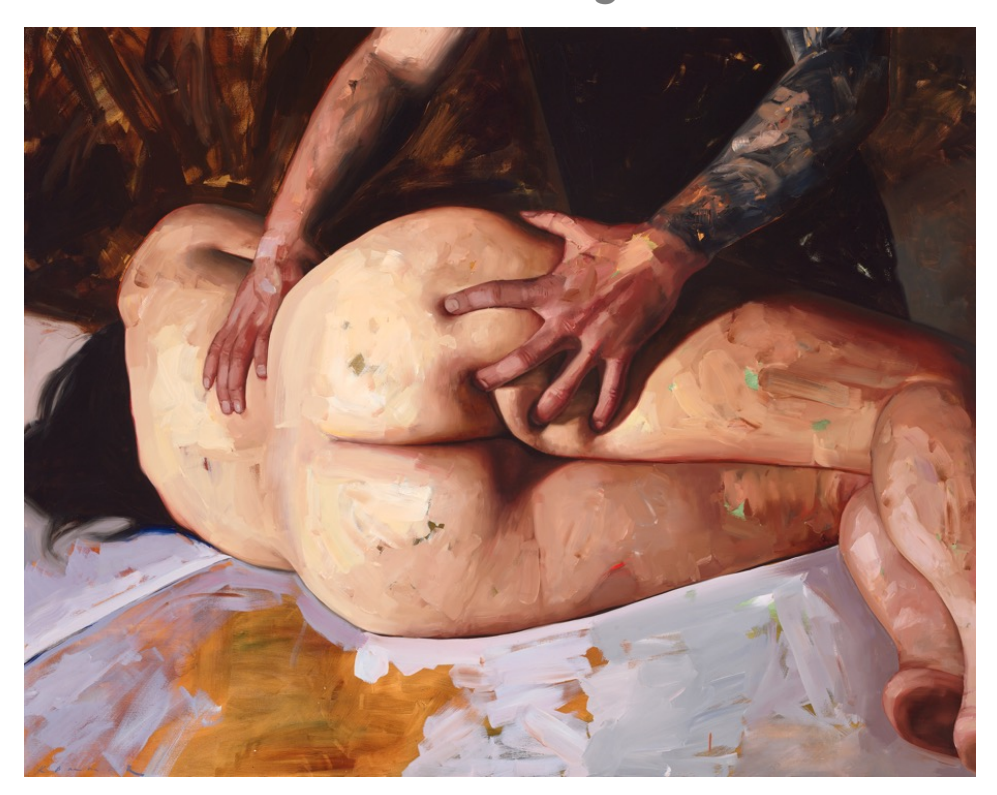
That's Normal, 2020, oil on canvas, 118 x 150 cm