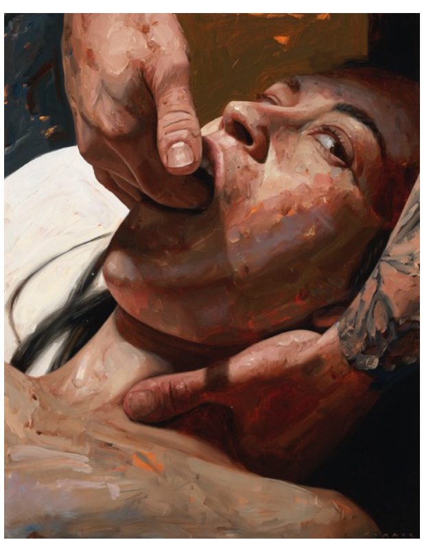
Languish, 2020, oil on canvas, 100 x 79 cm