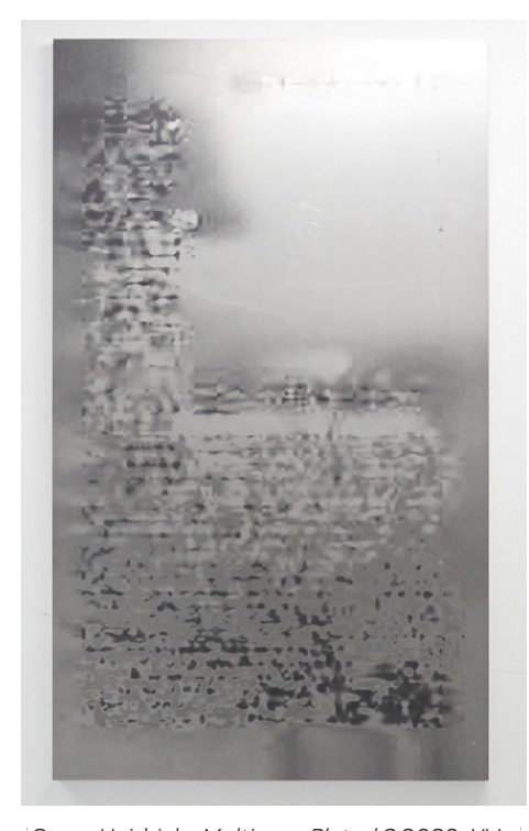
Orson Heidrich, Multispec Plated 2 , 2020, UV pigment on aluminum Plate on welded stainless steel frame, 145 x 85 cm

Orson Heidrich (b. 1996, Australia) is a mixed media artist whose practice spans across photography, video, sculpture and installation. Trained as a photographer, Heidrich uses the image, photographic and videographic, as a starting point. The imagery is then reinterpreted via the application of industrial printing techniques onto diverse industrial materials such as steel, aluminium, copper, glass and mirror. The changing mediums alter the final reception and impression of the same source imagery material. Sitting at the juncture between sculpture and print, Heidrich's works are hybrid objects.