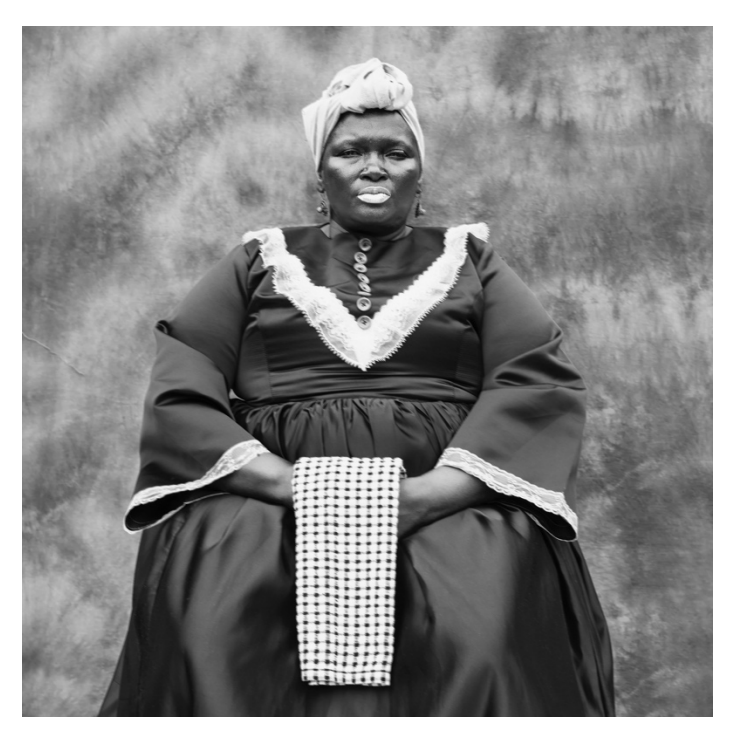
Fabrice Monteiro, Auntie , "8 Mile Wall" series, 2017, digital print on Canson Infinity Platine Fibre Rag 310 gsm, 120 x 120 cm / 80 x 80 cm