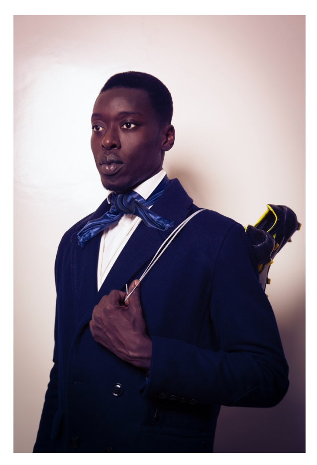
Omar Victor Diop, Kwasi Boakye, " Diaspora" series, 2014, inkjet print on Hanhnemüle paper, 60 \times 40 \text{ cm} / 120 \times 80 \text{ cm}