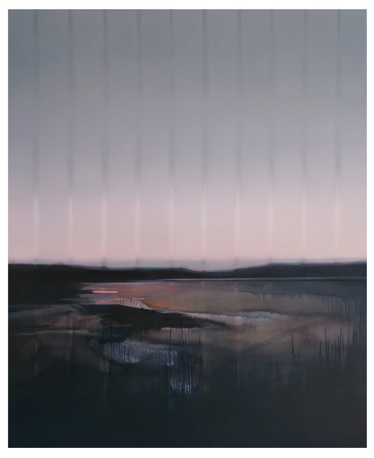
Slow Wave Cycle (Barragga Lake), 2021, oil on linen, 245 x 198 cm