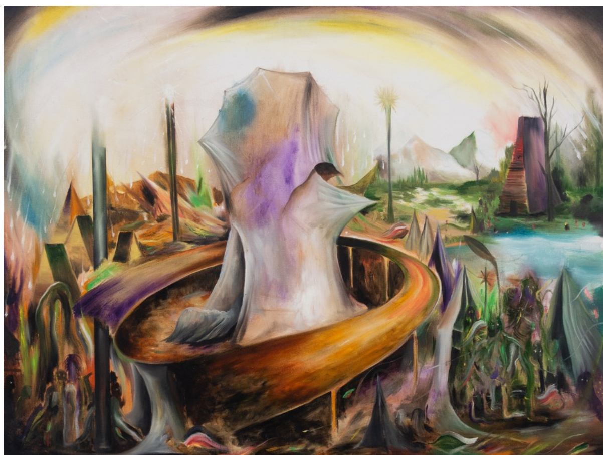
resonating together , 2021, oil on canvas, 77 x 102 cm