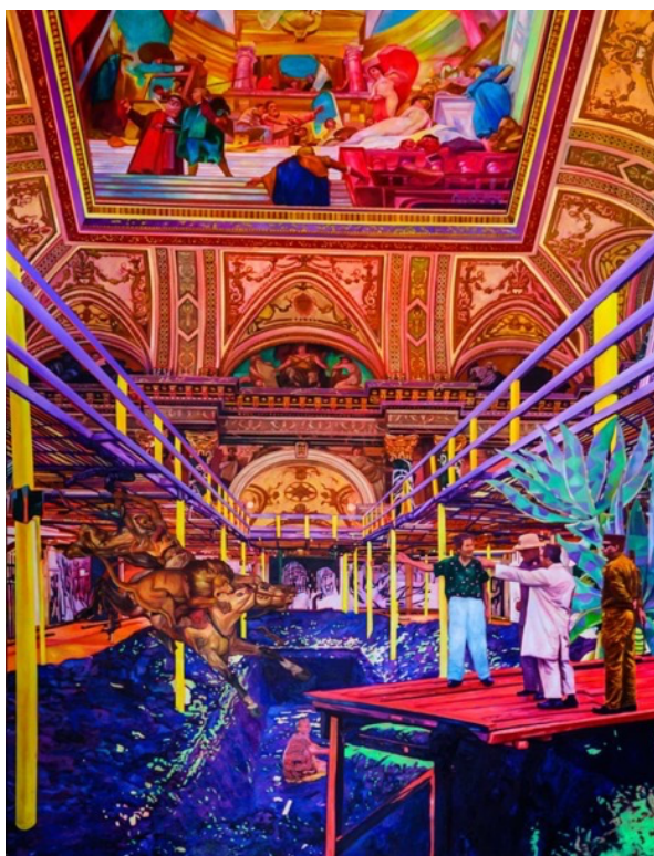
To mend a monument , oil and giclee on canvas, 200 x 150 cm