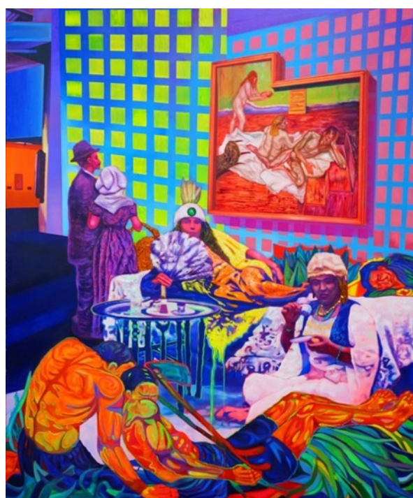
After all, you have that privilege and we have to deal with this shit , oil and giclee on canvas, 120 x 100 cm