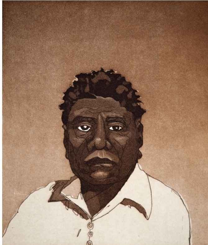
Vincent Namatjira, Albert Namatjira , 2015, etching with aquatint, 50 x 31.5 cm, edition 18/20