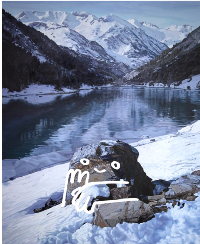
Abdul Abdullah, Pausing to reflect , oil on canvas, 198 x 162 cm