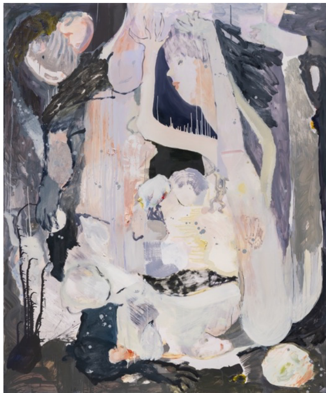
Karen Black, Falling in to you , 2023, oil on canvas, 183 x 152 cm