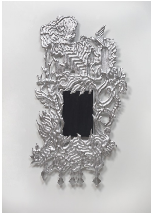
Caroline Rothwell, Ripple Effect, with Flame robin , 2023, carbon black (from Curowan megafire, stabilised), canvas, gypsum cement, epoxy resin, stainless steel, aluminium, mixed media, UV stable sealers, 148 x 81 x 10 cm