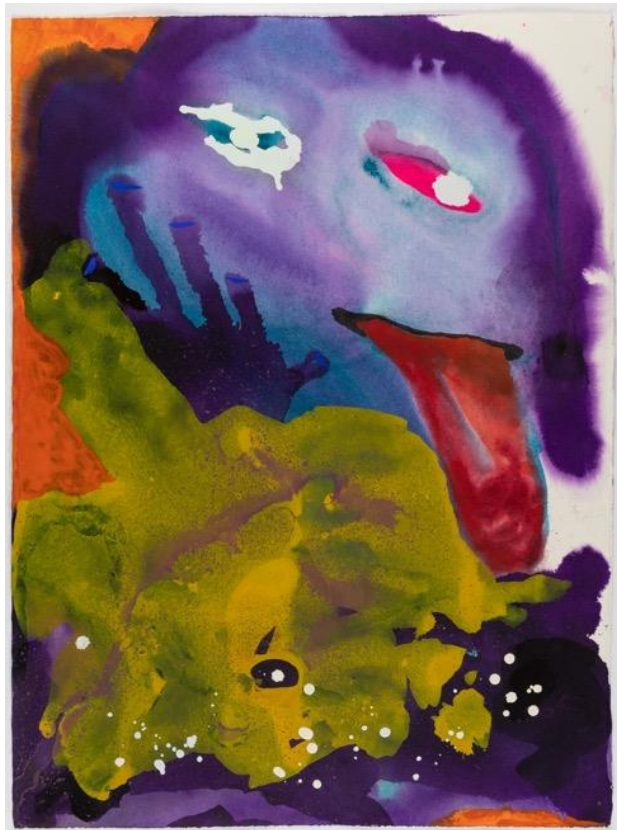
Tom Polo, ready to dissolve (pure pleasure) , 2023, acrylic and Flashe on paper, 76 x 56 cm