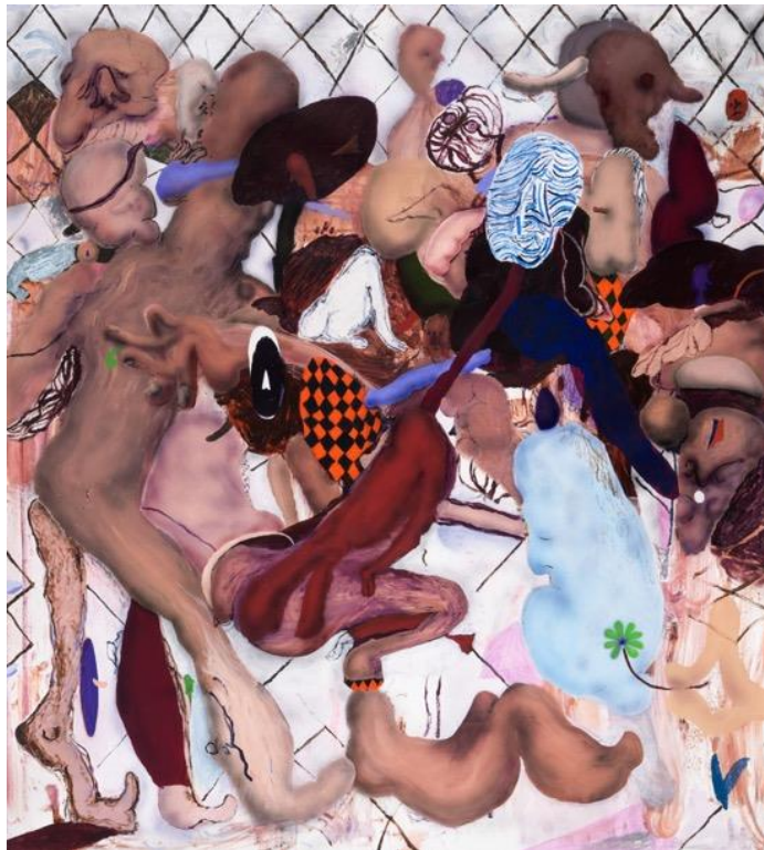
Nick Modrzewski, Tulip Thief , 2023, acrylic on canvas, 180 x 150 cm