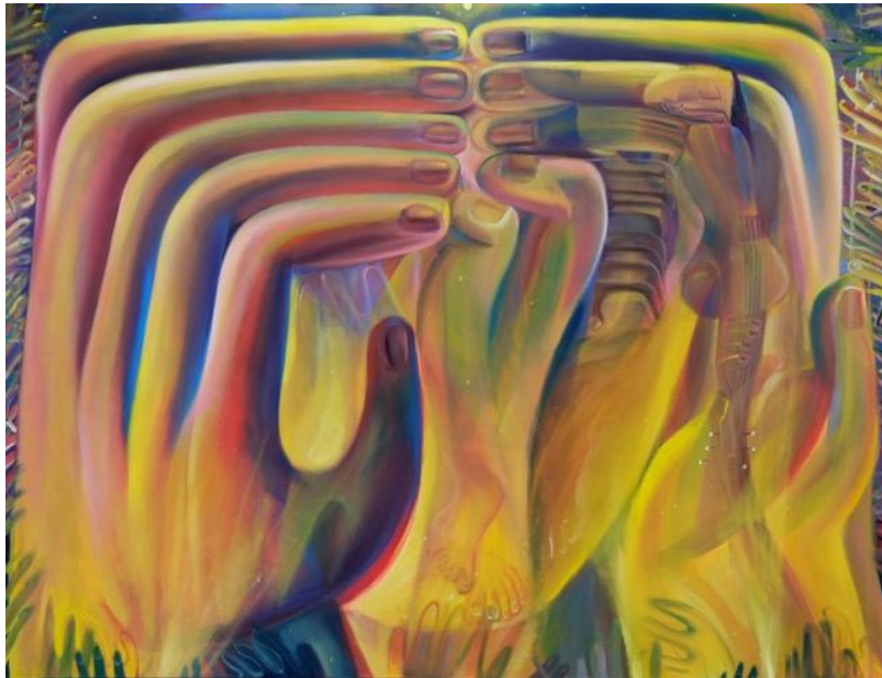
Alvin Ong, Applause , 2023, oil on canvas, 200 x 260 cm